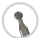
Round Diamond Burr