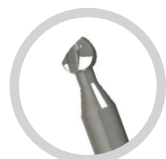
Round Cutting Burr