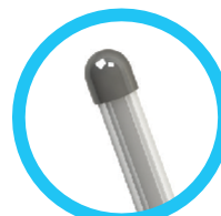
BSD 370 UL-W