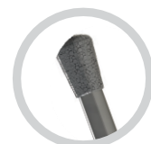
Inverted Cone Diamond Burr