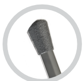
Inverted Cone Diamond Burr