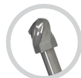
Cylinder Cutting Burr