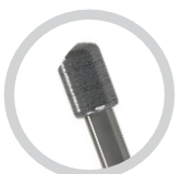
Cylinder Diamond Burr