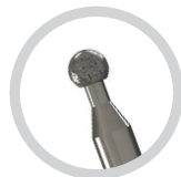
Round Diamond Burr