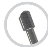
Cylinder Diamond Burr