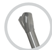
Inverted Cone Cutting Burr