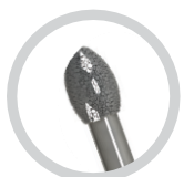
Egg Diamond Burr