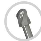
Cylinder Cutting Burr