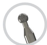
Round Diamond Burr