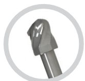
Cylinder Cutting Burr