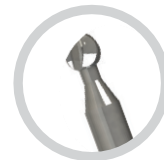
Round Cutting Burr