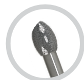
Egg Diamond Burr