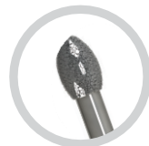
Egg Diamond Burr