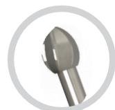
Egg Cutting Burr